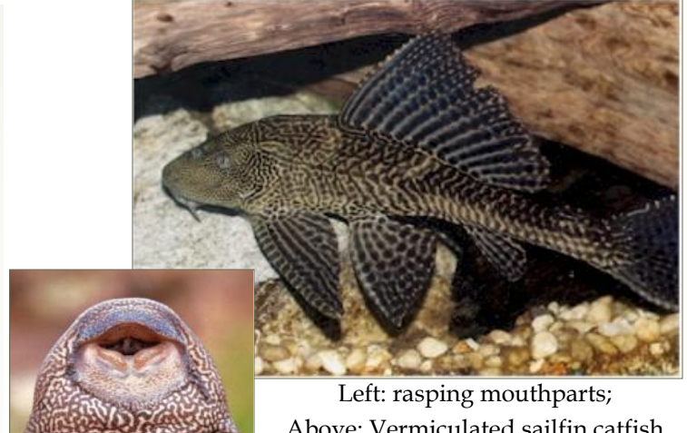
Above: Vermiculated sailfin catfish

In Florida, most reports of Hypostomus spp. (formerly genus Plecostomus) catfishes were misidentified Pterigoplichthys