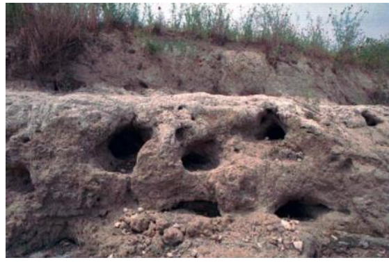
Suckermouth catfish burrows along the shoreline are exposed when water levels fall.