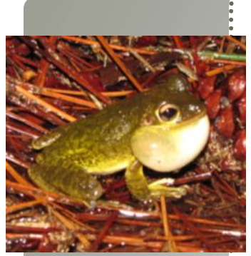
Calling male Cuban treefrog