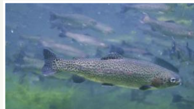
Rainbow Trout