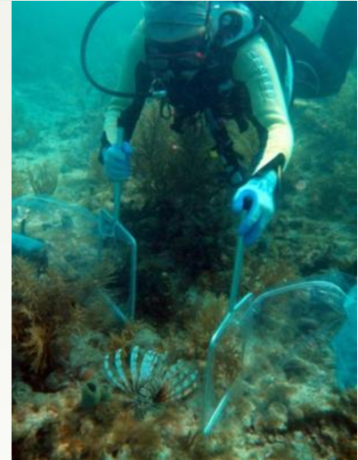
Lionfish being netted

In April, the FWC proposed several rule changes to curtail introductions of lionfish and facilitate removal. The proposed rules would prohibit live imports of lionfish to prevent additional introductions and create demand for Florida-caught lionfish. Furthermore, the proposed rules would prohibit aquaculture of lionfish to eliminate the potential of large-scale accidental releases. Additionally, the proposed rules eliminate regulatory barriers to facilitate lionfish removal. Harvest of marine fish when diving on a rebreather--a device that doesn't release bubbles that scare fish away--is currently prohibited; the proposed new rules would allow the use of a re-breather to harvest lionfish. The new rules would also allow permits to be issued for lionfish tournaments and thus permit spearfishing in areas where this method is typically prohibited. By issuing permits for spearfishing for special events only, impacts to public safety would be minimized. In June, the rules will be presented to the Commission for final approval. For more information, see 'Resources' (pg. 4).