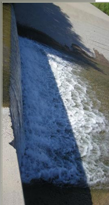
Physical fish barrier